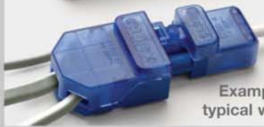
Example of typical wiring